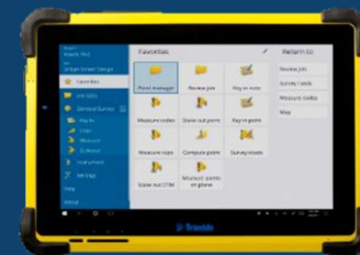
Trimble T10 Tablet