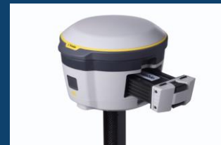
Trimble R2 GNSS Receiver